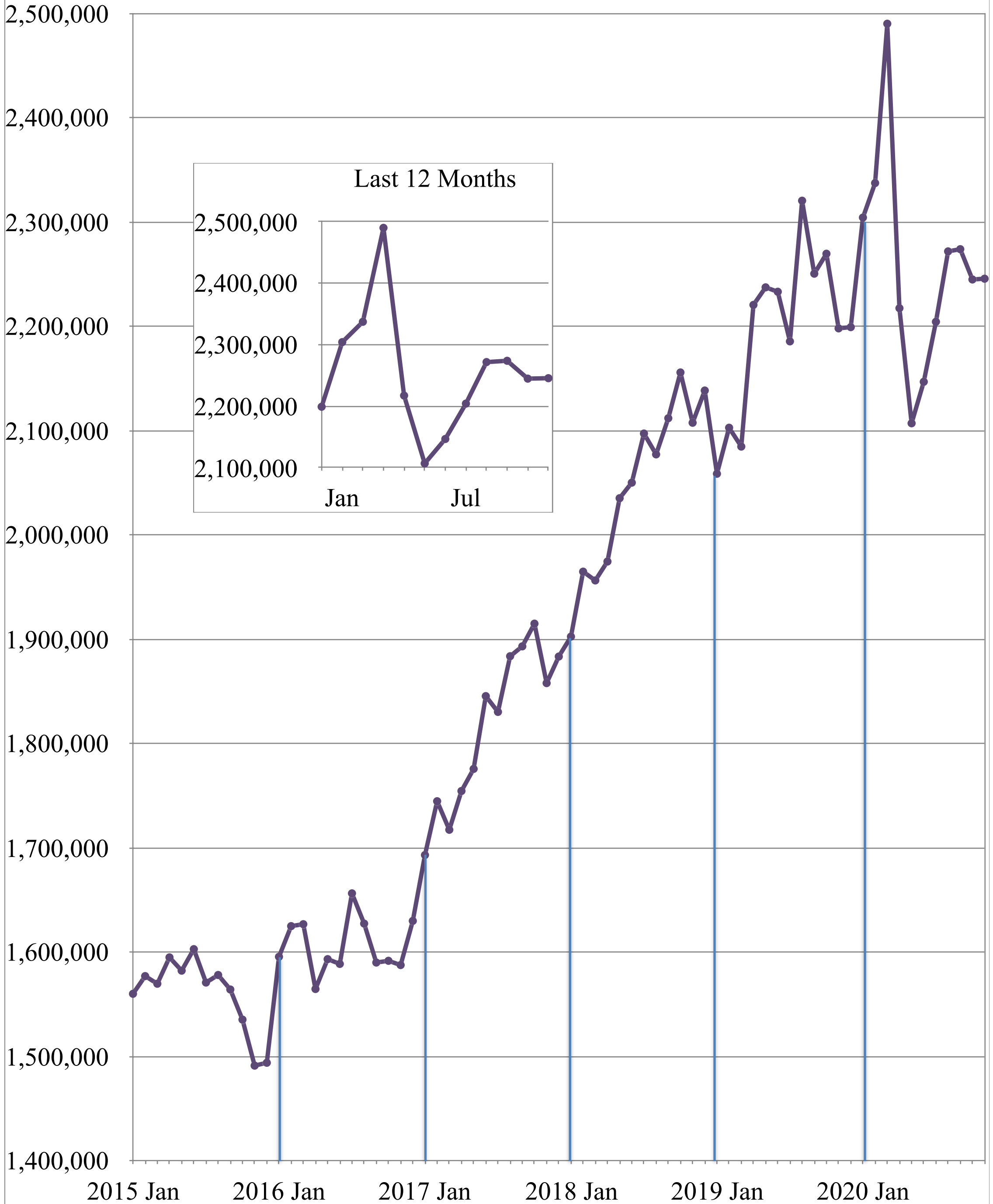
Average adjusted price for 'typical' Westmount house, by month, January 2015 to November 2020, based on accepted offer dates