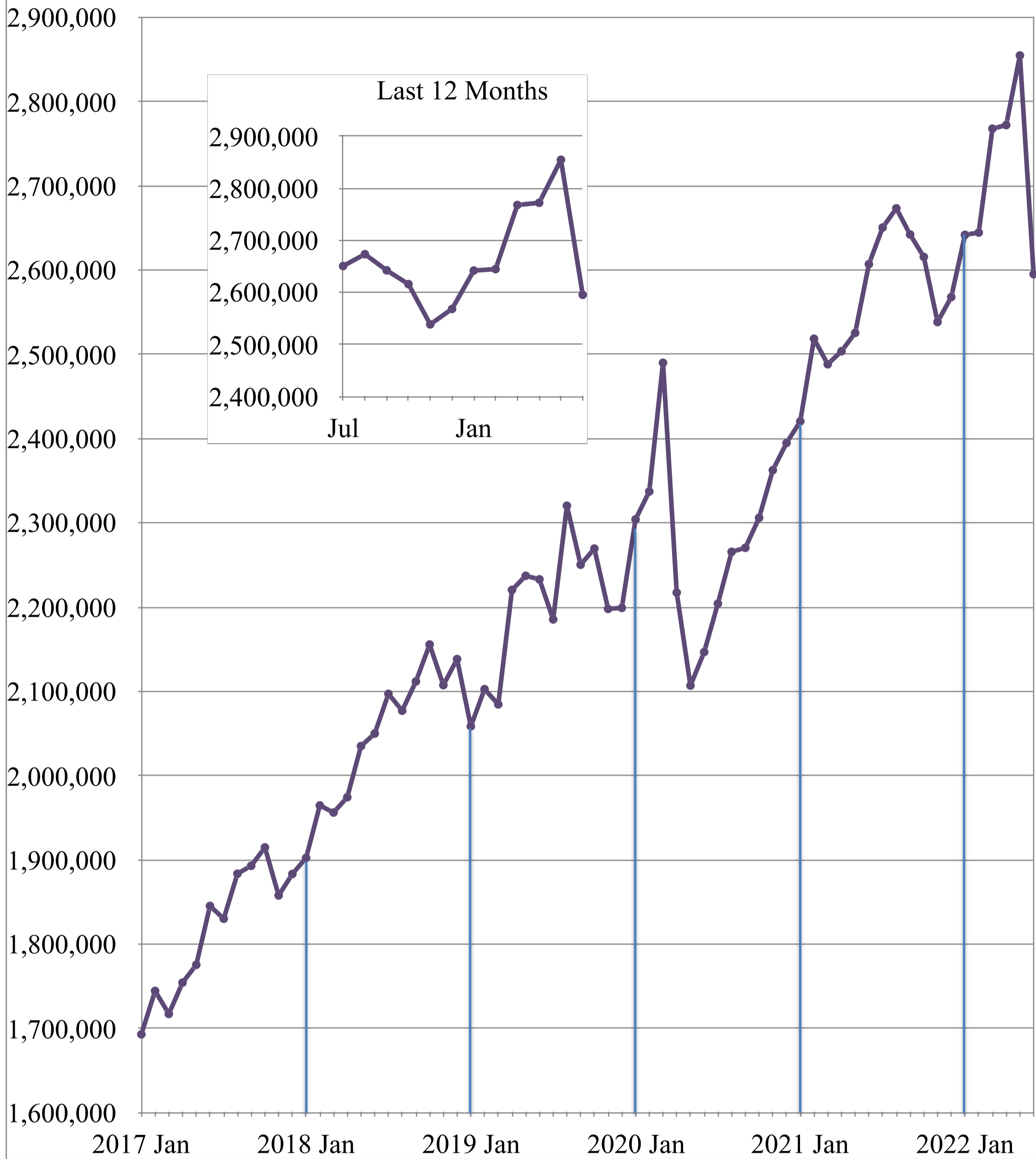
Average adjusted price for 'typical' Westmount house, by month, January 2017 to May 2022, based on accepted offer dates