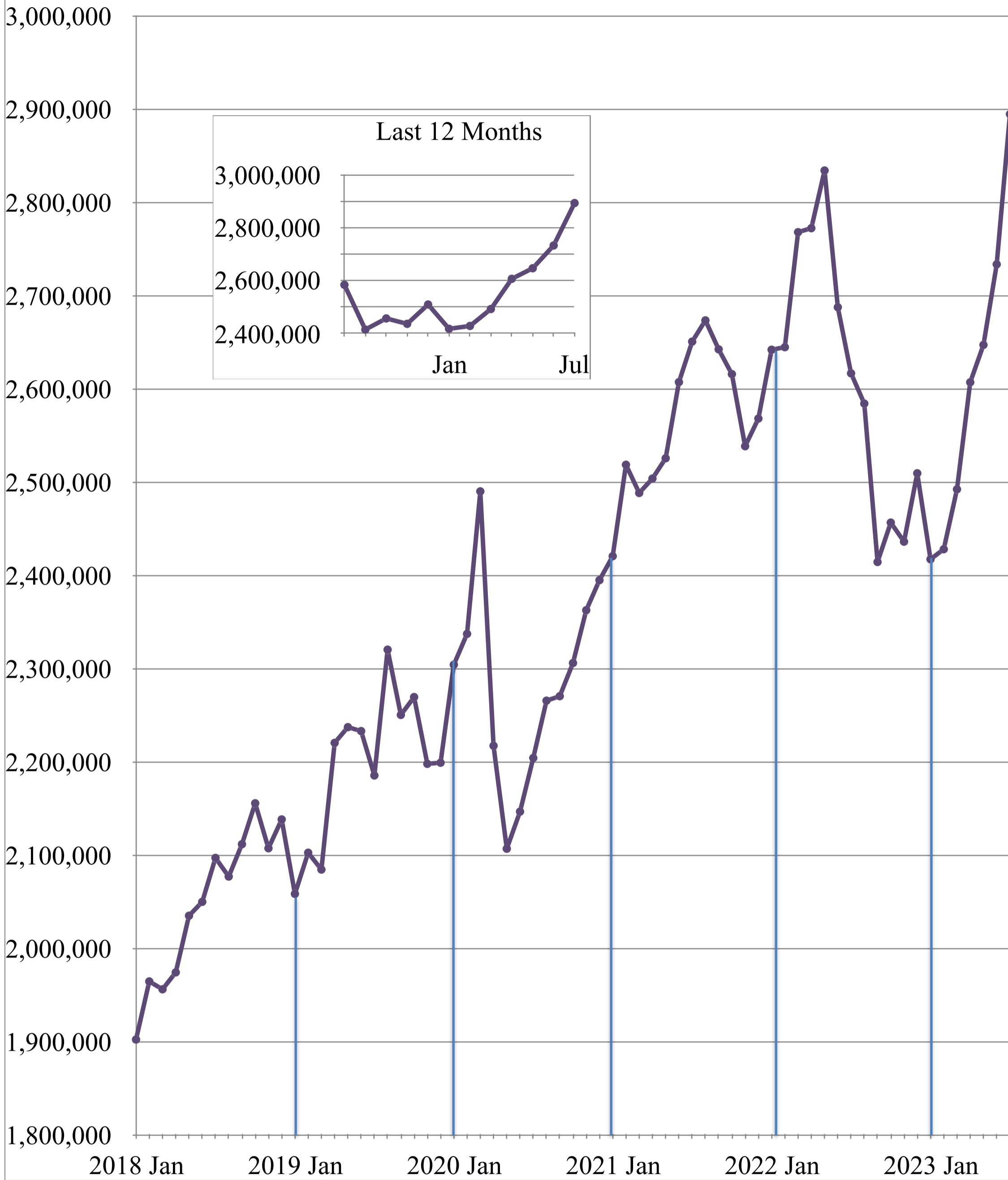
Average adjusted price for 'typical' Westmount house, by month, January 2018 to July 2023, based on accepted offer dates