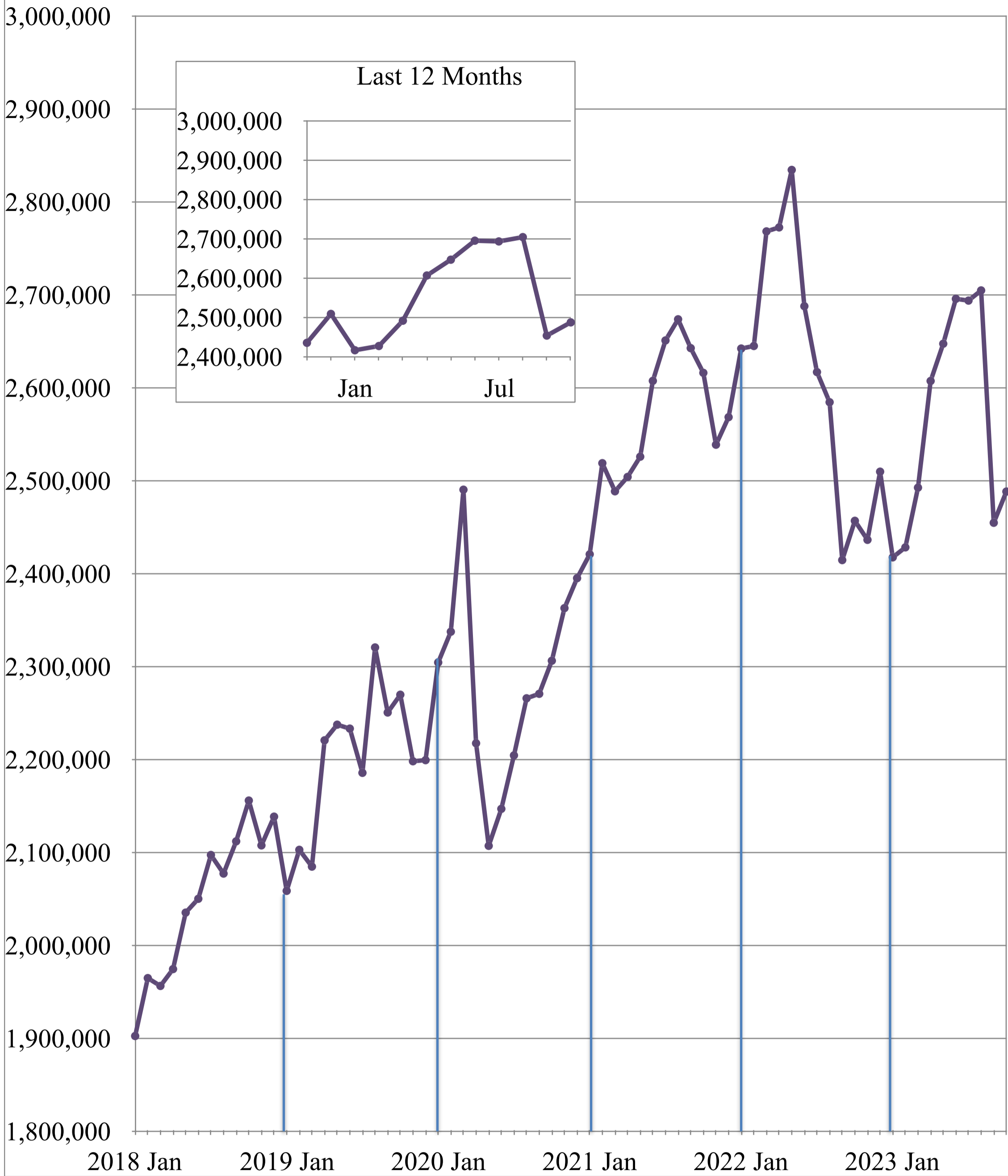
Average adjusted price for 'typical' Westmount house, by month, January 2018 to October 2023, based on accepted offer dates